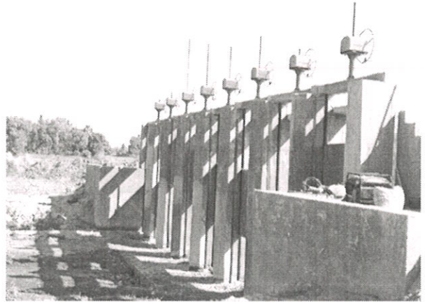
Impr.to Valathapitty Tank bund including Rip Rap in Ampara & Reconstruction of Nelluchchenai Anicut in Batticaloa