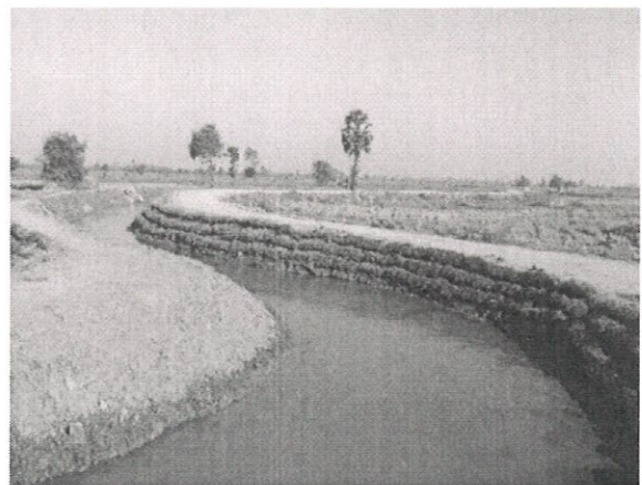
CRIP/WORKS/ID/HAM/S/284 in Hambantota & Construction of Irrigation channel from Sadawakkai High Level channel to Sinaveli Sinnalamveli tract in Batticaloa