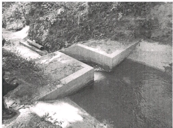
Canal D – 5, Hakwatuna Oya Scheme in Kurunegala & CRIP/WORKS/ID/PUT/CP/215-3 in Puttlam